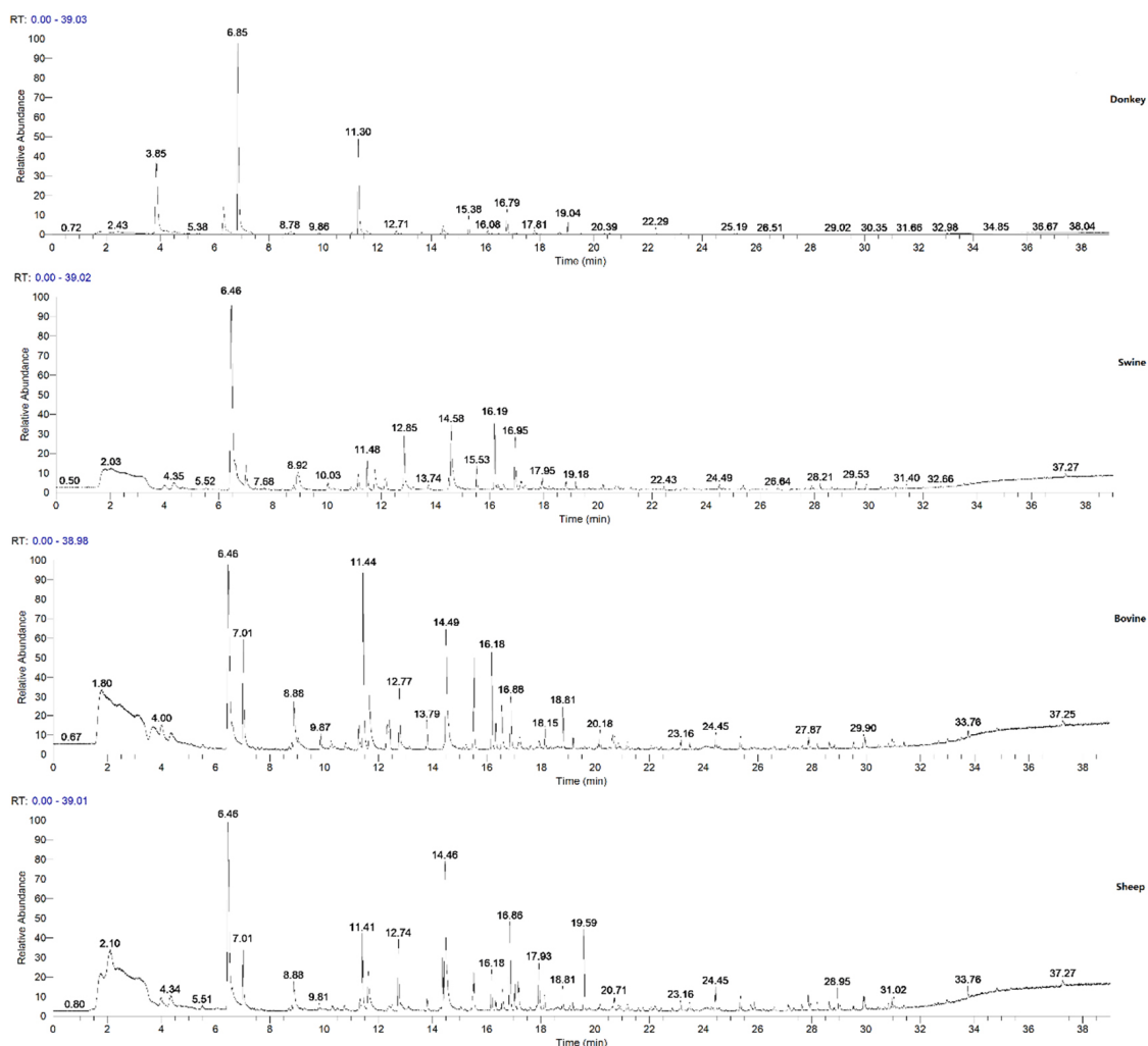
Fig. 3. Ion chromatogram of volatile flavor compounds in neck meats from donkey, swine, bovine, and sheep.