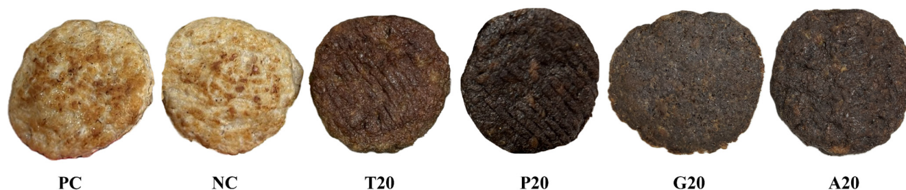
Fig. 2. Visual appearance of pork patties after cooking with various edible insect powders. PC, positive control; NC, negative control; T20, 20% Tenebrio molitor L. powder; P20, 20% Protaetia brevitarsis seulensis L. powder; G20, 20% Gryllus bimaculatus powder; A20, 20% Allomyrina dichotoma L. powder.

PC, positive control; NC, negative control; T20, 20% Tenebrio molitor L. powder; P20, 20% Protaetia brevitarsis seulensis L. powder; G20, 20% Gryllus bimaculatus powder; A20, 20% Allomyrina dichotoma L. powder.