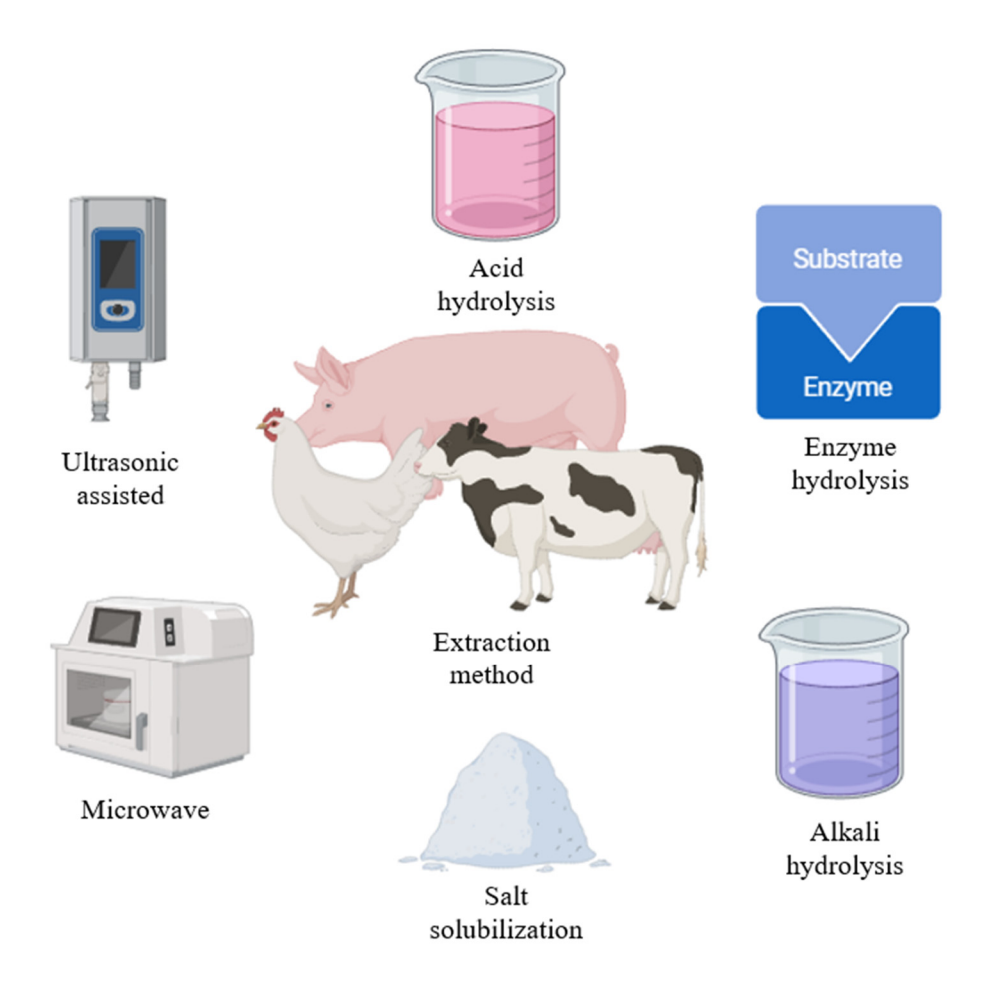
Fig. 1. Animal collagen extraction method.

are widely applied in cell culture and tissue engineering (Sun et al., 2018). Therefore, animal gelatin bioinks have high biocompatibility and cell adhesion, and the thermal stability and mechanical compatibility problems can be remedied by gelatin modifications such as GelMA. The by-products of animals can be extracted and used to reduce negative environmental impacts by utilizing waste and resources from the conventional animal breeding and slaughtering process to ensure a steady supply (Noble et al., 2024). Furthermore, animal gelatin is a suitable 3D bioprinting bioink for cultured meat production at a lower cost than that using collagen bioink (Table 1).